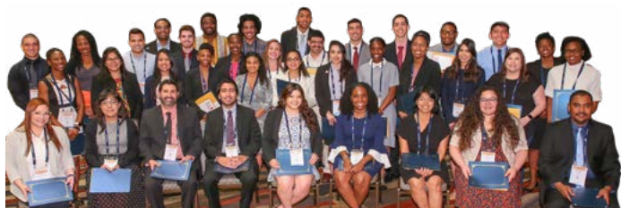
MTDS awardees are honored during the Diversity Forum at the ATS International Conference.

The cost for Diversity Forum lunch is $20.00.