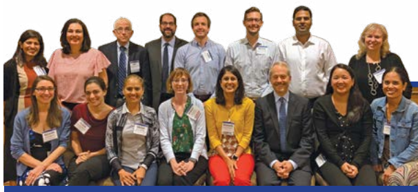
MITT Committee 2020