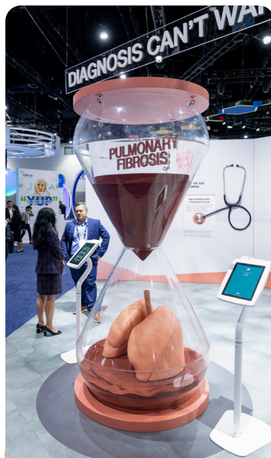
Exhibit Hall Traffic Builders

Additional room options are available outside the Exhibit Hall to accommodate your meeting needs. These are great for client meetings, focus groups, private demonstrations or for your staff. Business Suite rentals are available for full conference or two day rentals. Business Suite sales will open in Fall 2025.