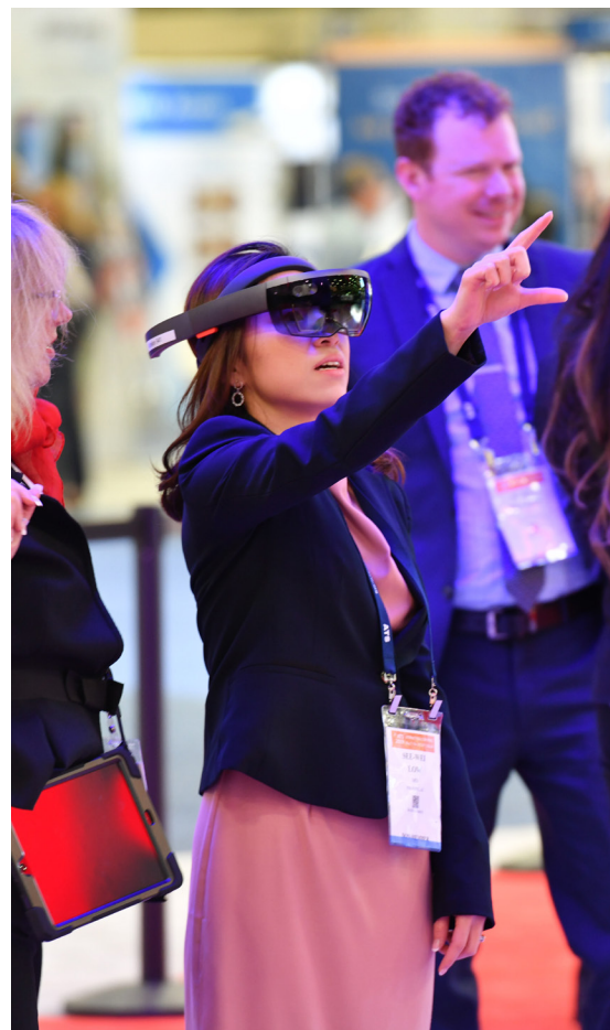
Exhibit Hall Traffic Builders

Additional room options are available outside the Exhibit Hall to accommodate your meeting needs. These are great for client meetings, focus groups, private demonstrations or for your staff. Discounted pricing is available for exhibiting companies. Meeting Suite and Meet-Up Room rentals are available for full day, half day, or hourly. Meeting Suite and Meeting-Up Room sales will open in Fall 2022.