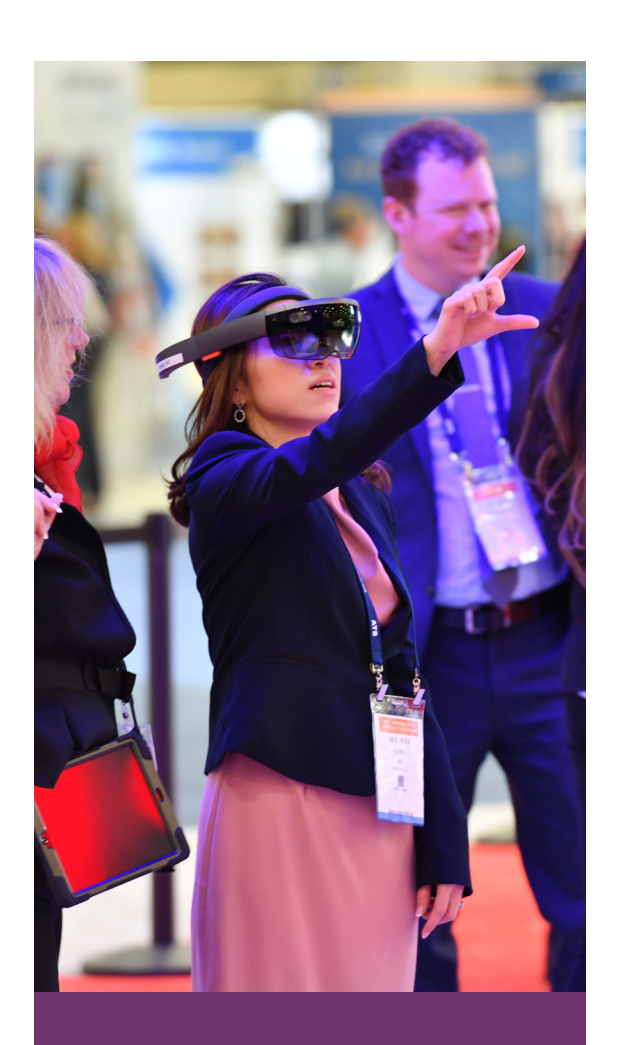
Exhibit Hall Traffic Builders

Additional room options are available outside the Exhibit Hall to accommodate your meeting needs. These are great for client meetings, focus groups, private demonstrations or for your staff. Discounted pricing is available for exhibiting companies. Meeting Suite and Meet-Up Room rentals are available for full day, half day, or hourly. Meeting Suite and Meeting-Up Room sales will open in Fall 2022.