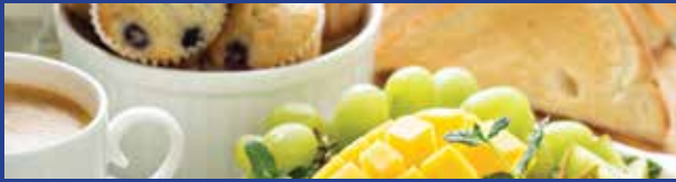
EXHIBIT HALL HIGHLIGHTS